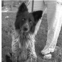
Elf Class of '04