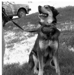
Rex Class of '04